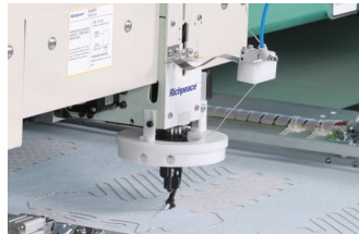
Independent wire reel feeding system

Automatic clamping, fixed fabric tightly. Including clamp & hold, stretching feature, ensure fabric flat without wrinkle.