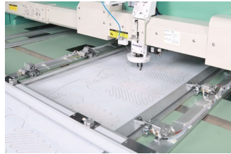
Automatic sewing frame

18.Real-time adjustment according to the demand of wiring, to satisfy the required of wiring and do not make wire material overfilled.