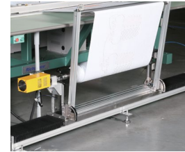
Automatic bobbin change device

Patented design, auto trimming, precisely and reliable cut, cutter not return home position, machine stops and alarms.